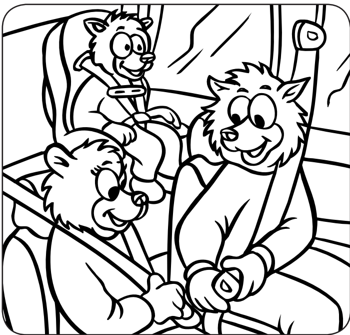
Ask everyone to buckle up before the car starts.